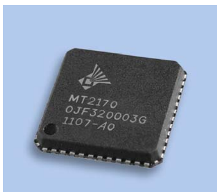
MT2170 Single-Chip DOCSIS 3.0 Wideband Tuner

The MT2170 is a low-power, single-chip DOCSIS 3.0 wideband tuner with an integrated IF variable gain amplifier.