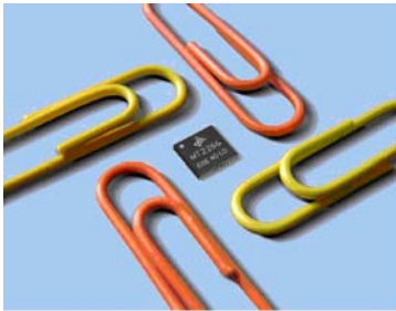
MT2266 Single Chip Dual-Band Tuner

The MT2266 is a direct conversion low-power single-chip broadband tuner for VHF Band III and UHF applications.